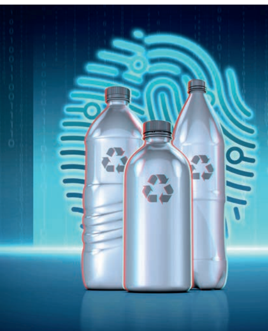
Fig. 2. The NIR Silver range of metal effect pigments developed by Eckart can be employed in various plastics. The characteristic fingerprints of the various polymers remain detectable.

NIR Silver is available in three degrees of fineness. As a result, different looks are achievable: from an elegant, texture-less silver-gray to a very industrial steel-gray to a shimmering silver-sparkle effect ( Fig. 4 ). The pigments are easy to incorporate into all standard polymers. In particular, polyethylene terephthal- »