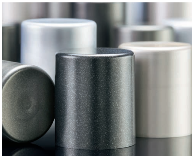
Fig. 4. Eckart offers different pigment preparations in the product series that enable a very wide range of silver designs to be implemented. © Eckart