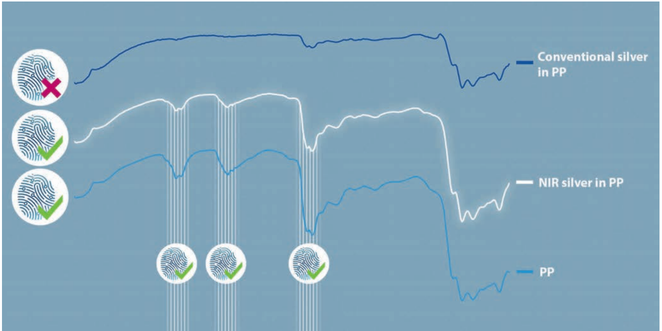
Fig. 3. Conventional silver pigments interfere with the plastic's specific fingerprint and prevent it from being recognized by sorting systems. In contrast, NIR Silver causes very little interference and this ensures good detectability.

ate (PET), low and high density polyethylene (LDPE and HDPE), polypropylene (PP) and polystyrene (PS), which are prime recycling candidates, readily lend themselves to pigmentation with NIR Silver. The pigments are authorized for use in the food-packaging sector. They meet all regulatory requirements on product safety in key regions. Custom coloring in a very wide range of shades and effects is accessible through combinations with both organic and inorganic colored pigments. The degree of gloss and hiding power can be customized as well, thereby providing extensive formulation freedom.